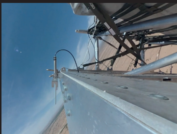
Fig 3: Activated LISAD System