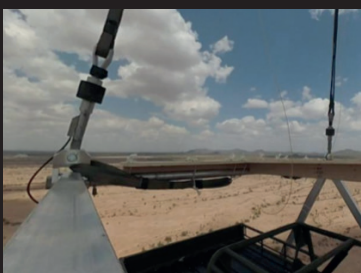
Fig 4: Disconnect linked to parachutes