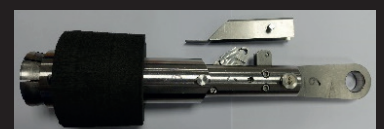
Fig 9: RCAD Disconnect