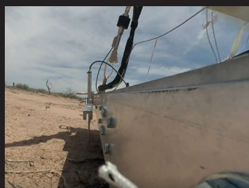
Fig 5: LISAD triggering upon impact