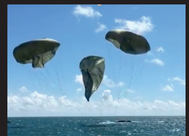
Fig 8: Parachute disconnect upon splashdown