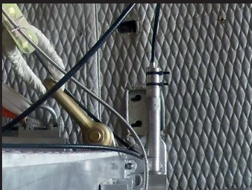
Fig 2: LISAD in aircraft