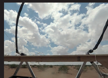
Fig 6: Disconnect releasing