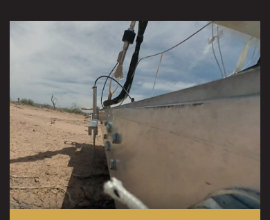
Fig 5: LISAD triggering upon impact