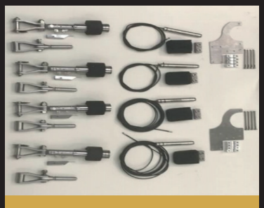
Fig 7: WISAD boat equipment set

Commercial manual and part numbers available upon request